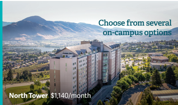
North Tower $1,140/month

TRU offers guaranteed housing for first-year international students who apply early. Living on or near campus is a great way to settle in, make friends and stay connected to university life.