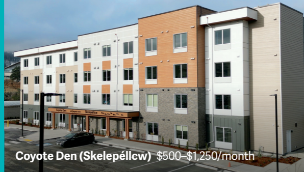
Coyote Den (Skelepéllcw) $500-$1,250/month