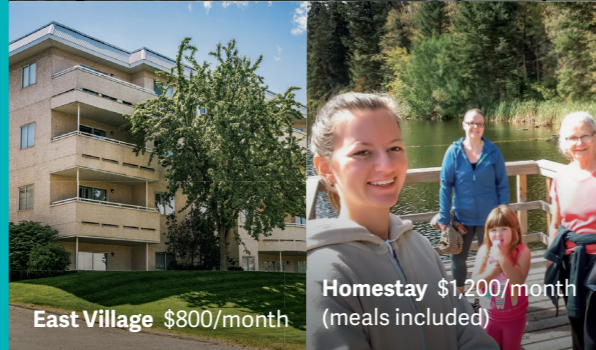
East Village $800/month